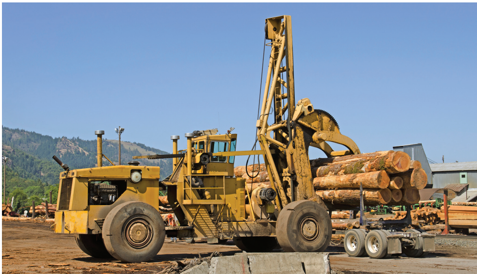
The port will procure two log handlers similar to the one in this stock photo.