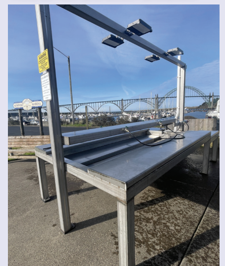
The first of two new file tables has been installed at the South Beach Marina. The Port of Newport thanks Business Oregon for their support of this project.